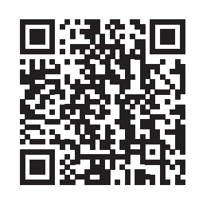
Find a mental health or learning enhancement workshop