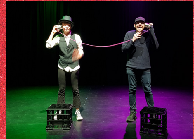
Bab Crabulous and the Dinosaur Dilemma by The Mudcrabs