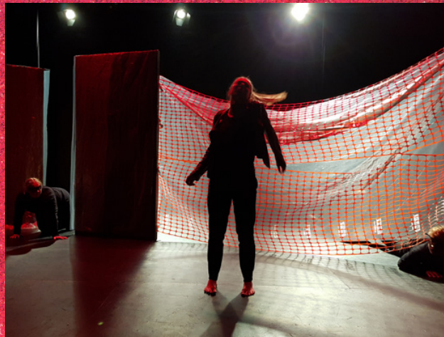
The Metamorphosis by MU Modern

Chinese Theatre Group presented a comedy based on the story of the Wing Chun Master, Ip Man.