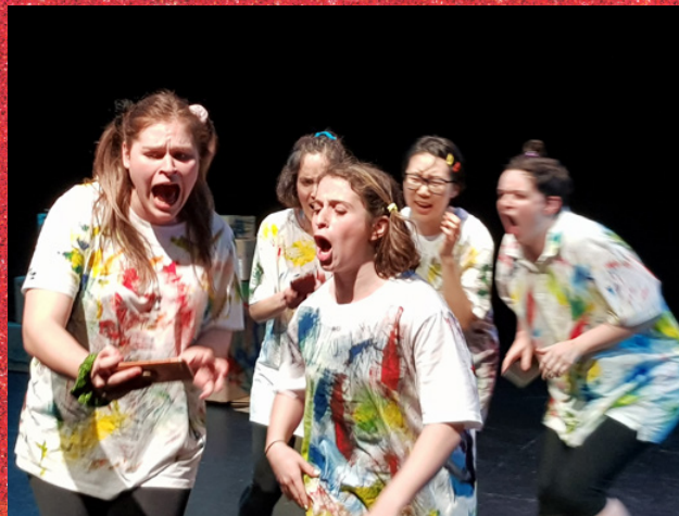
The Playground by Four Letter Word Theatre