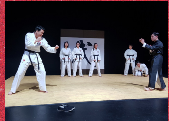
Kung-Fu Man by Chinese Theatre Group