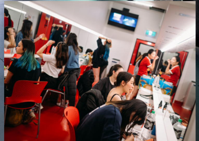
Flare Dance Ensemble backstage